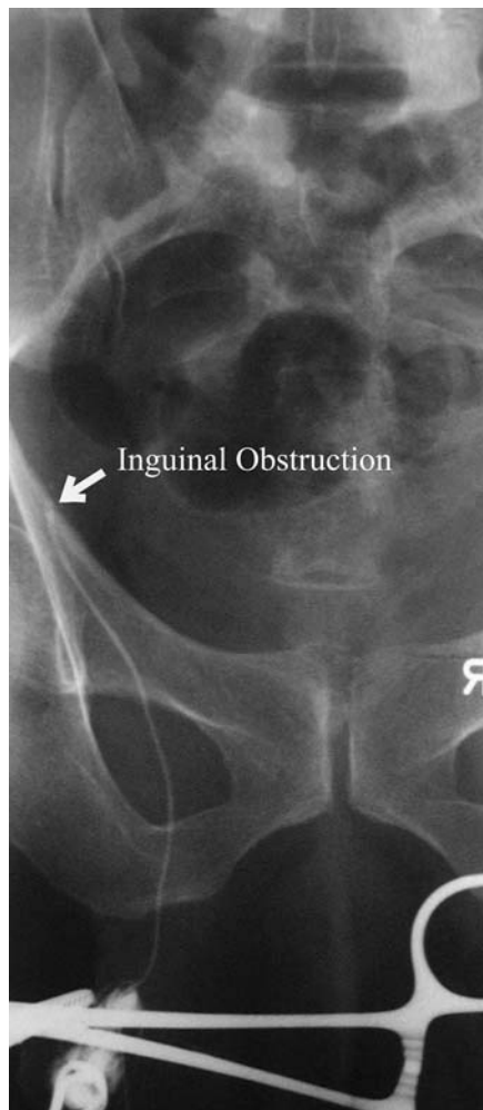
FIG. 1. Vasography shows inguinal obstruction (arrow)